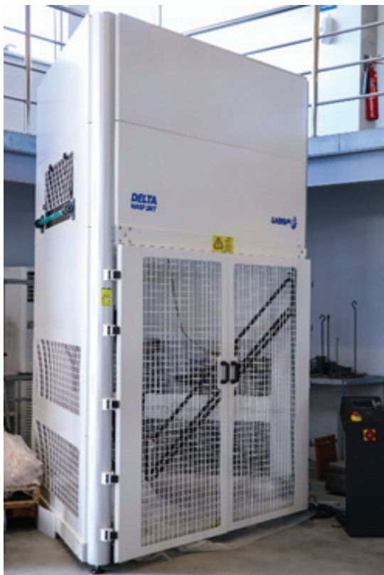
3D Printer for Cement - Based Materials

Last, the consortium partners are also working on the development of guidelines for a Strategic Action Plan for recycled CDW Reuse, aiming to identify and report possible mechanisms that can assist in the successful implementation of a recycled CDW reuse scheme in Cyprus. Towards this end, a questionnaire has been developed and will be disseminated in September 2021 to the key stakeholders of the CDW reuse program to solicit their perceptions.