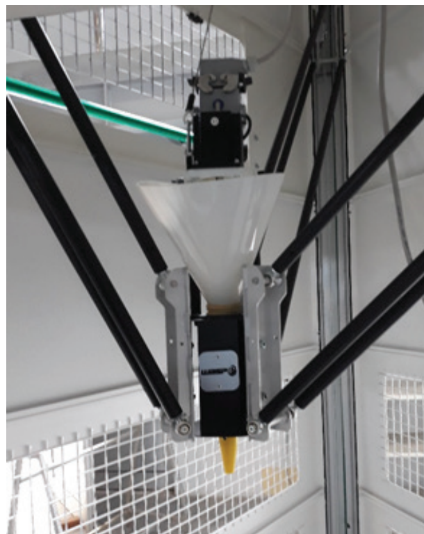
3D Printer Nozzle

Moreover, preliminary work has been conducted regarding the development of the fire and thermal insulation materials coming from the CDW, along with the prototype that will combine the fire resistance and the insulation properties. Progress is also taking place for the engineering of the properties for the material production. Further to the production of the new materials with traditional methods (i.e. casting), work has been also conducted on their development with 3D-printing, by modifying the original syntheses.